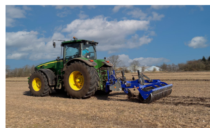
SUBSOILER M Profi

DALBO A/S, Bindeballevej 69, DK-7183 Randbøl, Tel.: +45 75 88 35 00, info@dalboagro.com , www.dalboagro.com