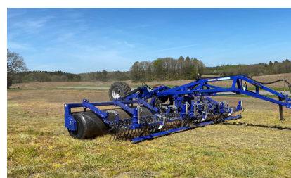
MAXIROLL GREENLINE 630-830