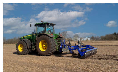
SUBSOILER M Profi

DALBO A/S, Bindeballevej 69, DK-7183 Randbøl Tel.: +45 75 88 35 00, info@dalboagro.com, www.dalboagro.com