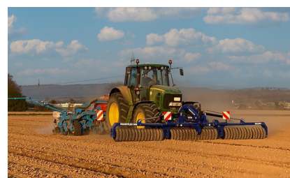
FRONT PRESSES 150-600